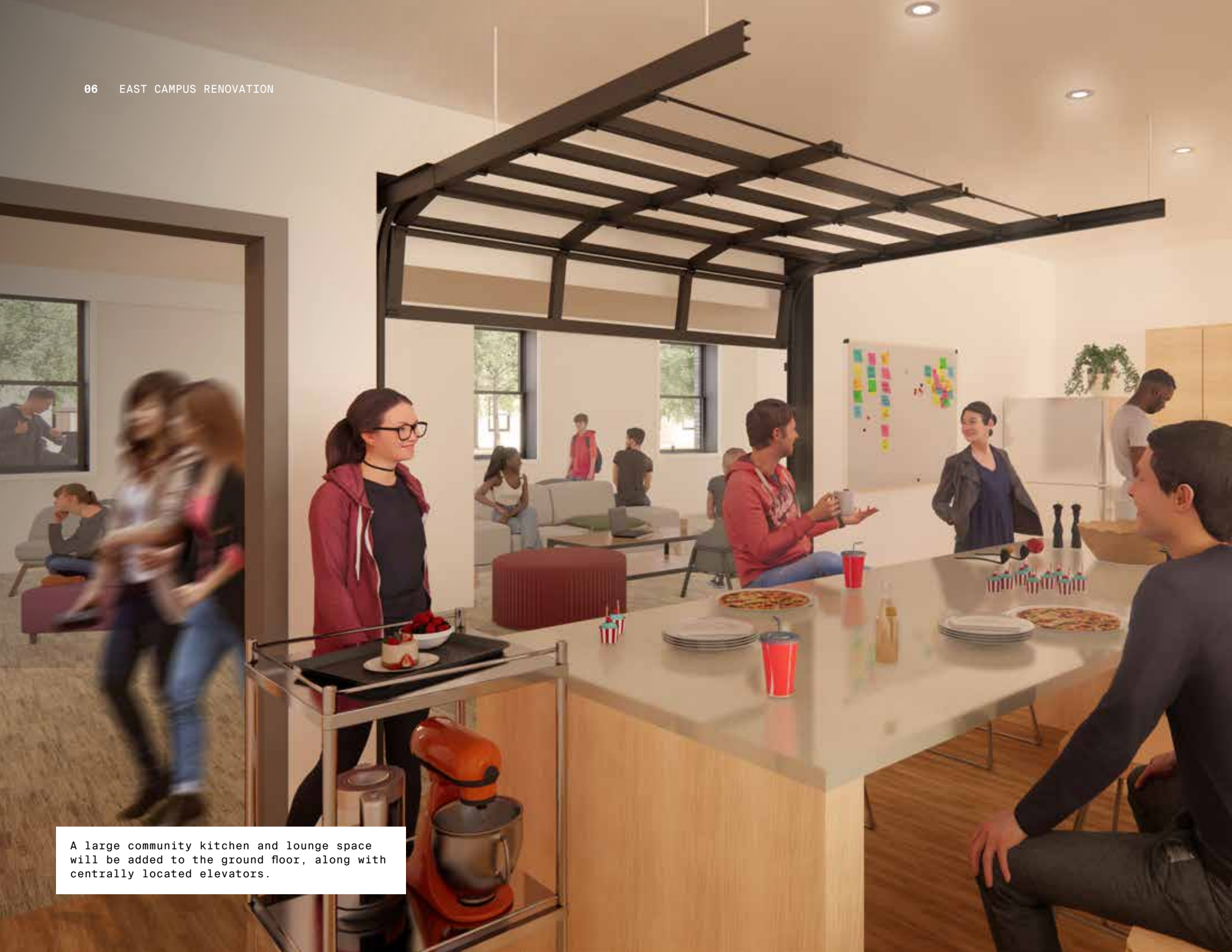
A large community kitchen and lounge space will be added to the ground floor, along with centrally located elevators.