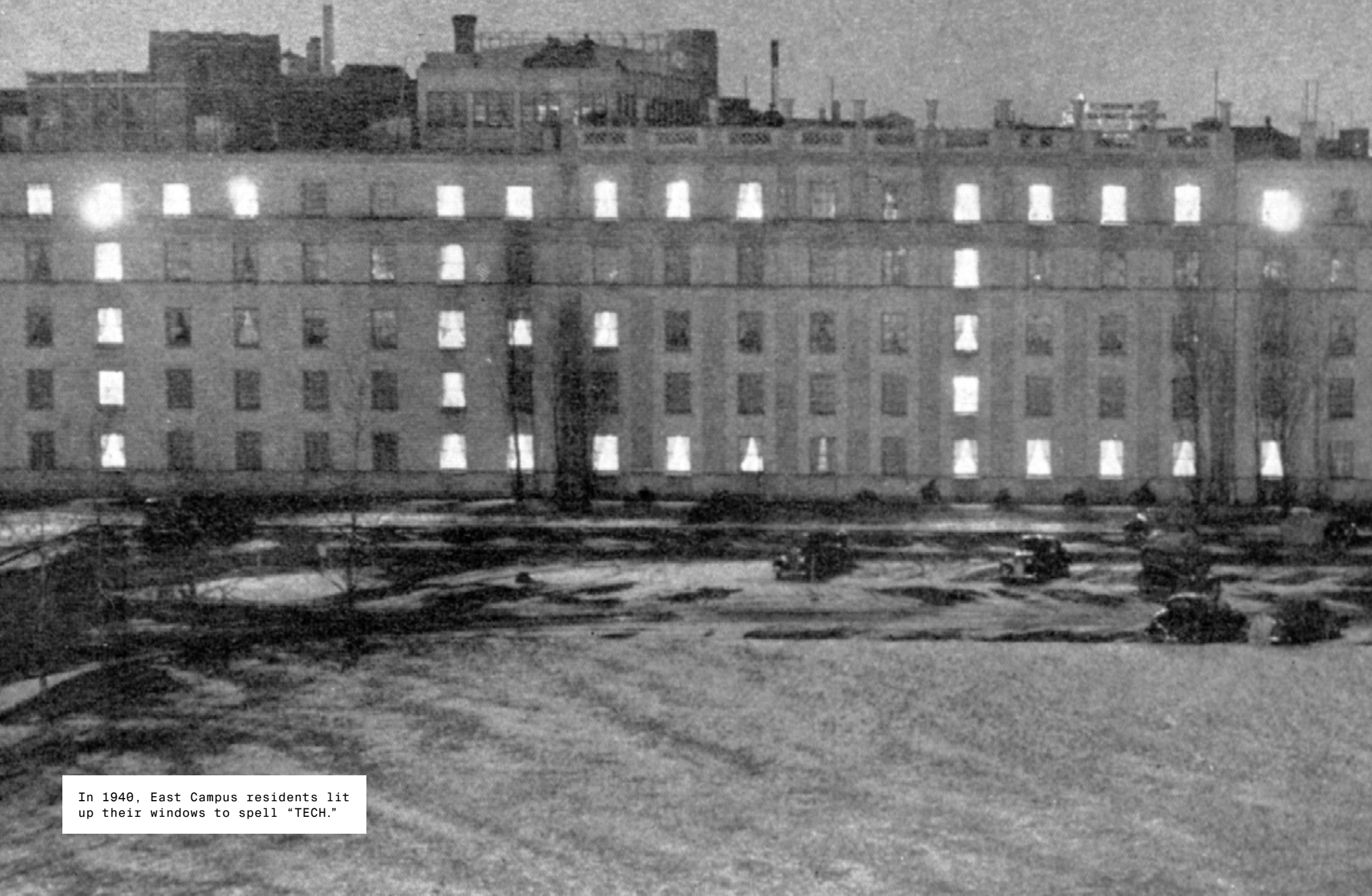
In 1940, East Campus residents lit up their windows to spell "TECH."