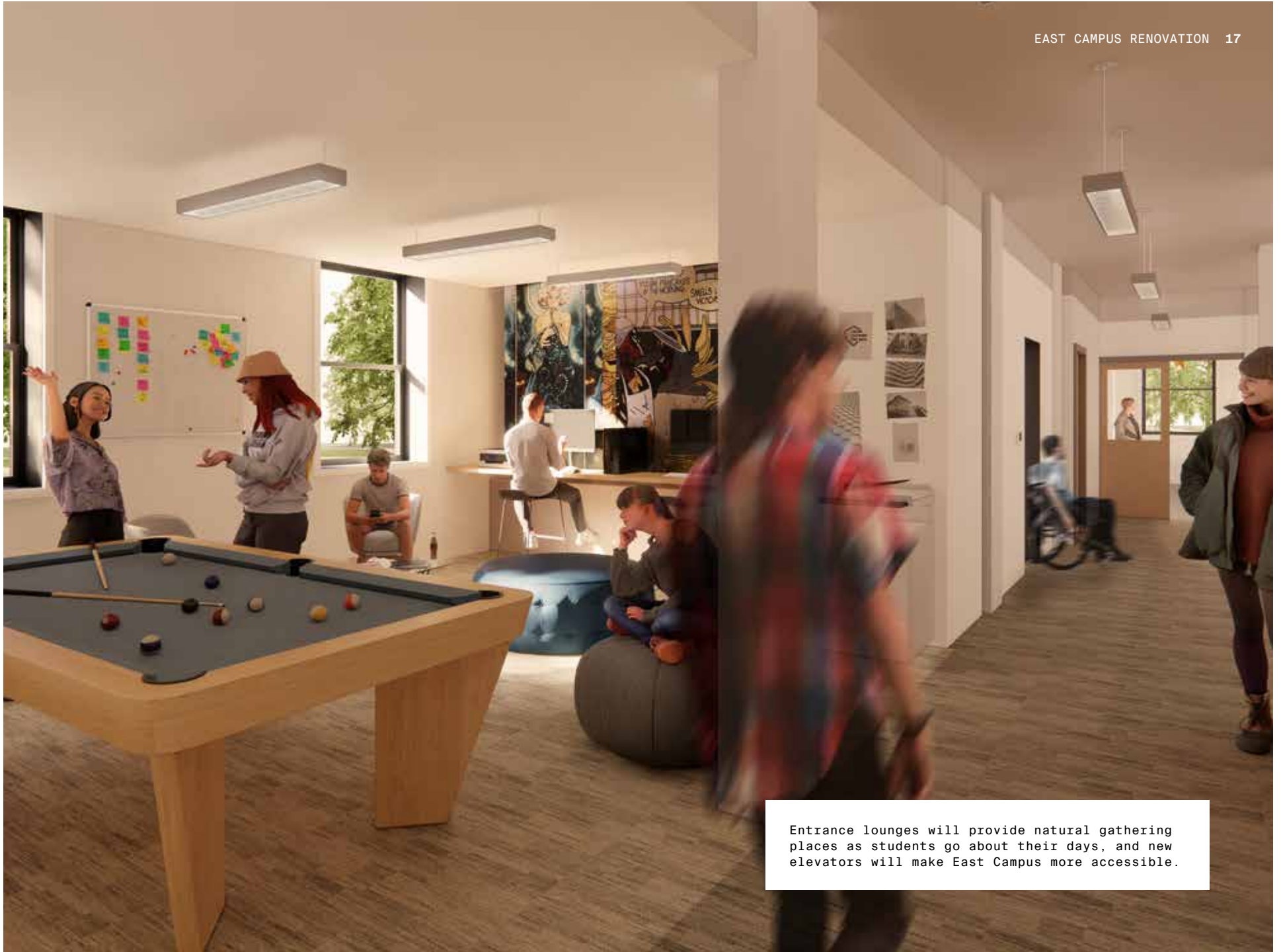
Entrance lounges will provide natural gathering places as students go about their days, and new elevators will make East Campus more accessible.